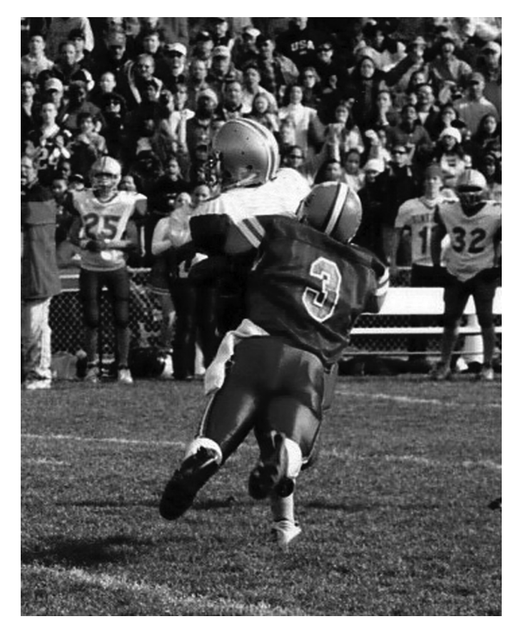
Figure 2. Initiating contact with the shoulder while keeping the head up reduces the risk of head and neck injuries.

down position and at risk of serious injury. Evidence Category: C