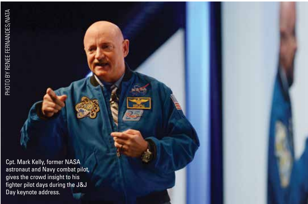
Cpt. Mark Kelly, former NASA astronaut and Navy combat pilot, gives the crowd insight to his fighter pilot days during the J&J Day keynote address.

Judging by the intimidating resume — U.S. Navy veteran, former astronaut, author and cancer survivor, just to name a few — one might wonder if convention keynote speaker Mark Kelly is actually from this planet. But Kelly quickly dispelled these speculations during his keynote presentation at the General Session late Friday afternoon.