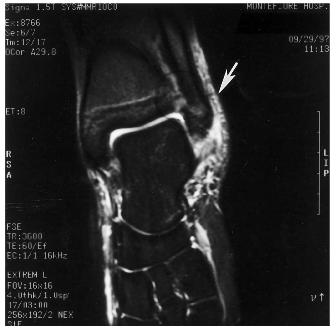
Figure 2. MRI taken 3 days after the injury does not conclusively show any damage to the peroneal retinaculum. However, effusion lateral to the fibula is seen.

Initially, the goal of treatment was to minimize the effusion and regain full range of motion through the use of heating modalities, ultrasound, elevation, massage, and stretching. Also, at this time, open chain strength exercises and non-weightbearing Biomechanical Ankle Platform System exercises (BAPS, Alimed Inc, Dedham, MA) were instituted. Throughout this time, the athlete was walking, crutch assisted, but he refused to wear a walking boot. As his strength increased and he was able to perform normal daily activities, we started closed chain exercises, including leg presses, lunges, stair climber exercises, and full weightbearing BAPS with platform loading. Within a week, the athlete was rated 5/5 on the manual muscle testing score for all ranges of motion. However, snapping occurred with plantar flexion and eversion, and the tendons needed to be stabilized with tape so that